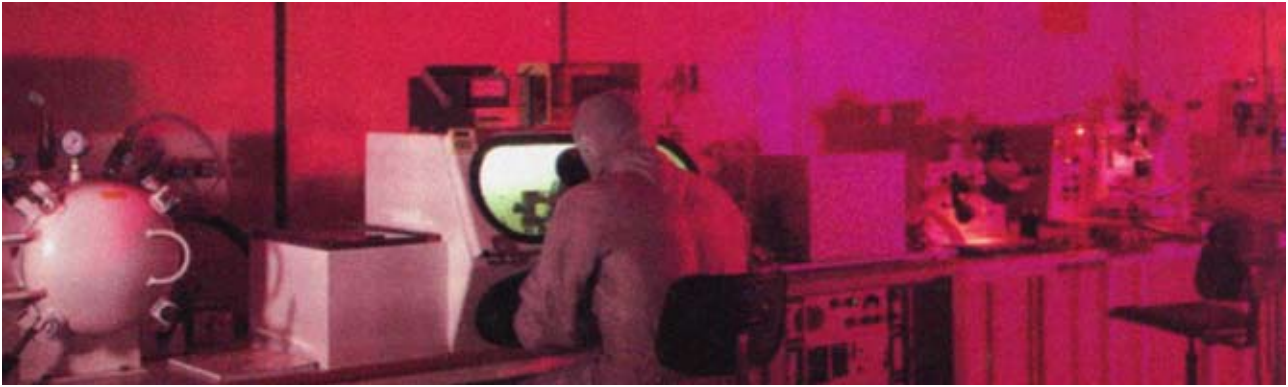
Detector manufacture and test facilities