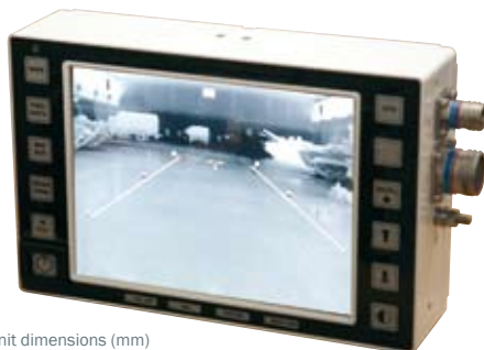
Drivers Display Unit dimensions (mm) Width 248mm, Height 160mm, and Depth 66mm

The Driver's Display Unit (DDU) is a high performance multi function SVGA resolution display that has been designed for use in Armoured Vehicle. It utilises an 8.4inch colour LCD flat panel display with illuminated controls and indicators arranged around the screen. The LCD screen is protected by a toughened, anti-reflection coated glass plate and includes an EMC mesh screen.