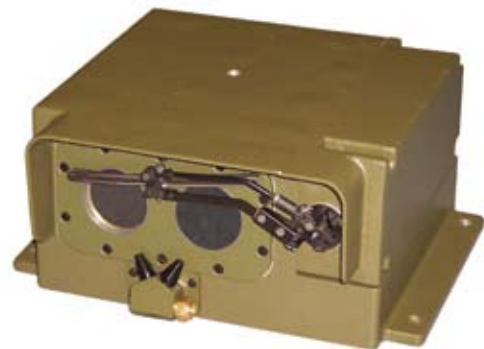
DNVS 2 dimensions (mm) 148 height, 270 depth, 275 width and 30 for the edge of the plate

For more information please email sales.marketing@selexgalileo.com