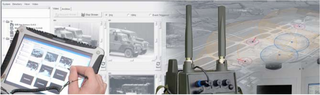
Dynamic, real-time detection, location and tracking of vehicle targets