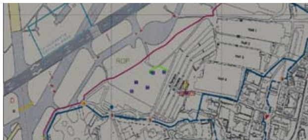
HYDRA situational awareness tool

If imaging nodes are deployed within the sensor field, they would be cued by the acoustic tracking, in order to provide the user with video, which is used to determine the level of threat.