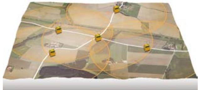
Hydra network sensing scenario

The scenario above illustrates how acoustic sensors can be utilised to maintain persistent surveillance of threats irrespective of the sensor positions and line-of-sight limitations.