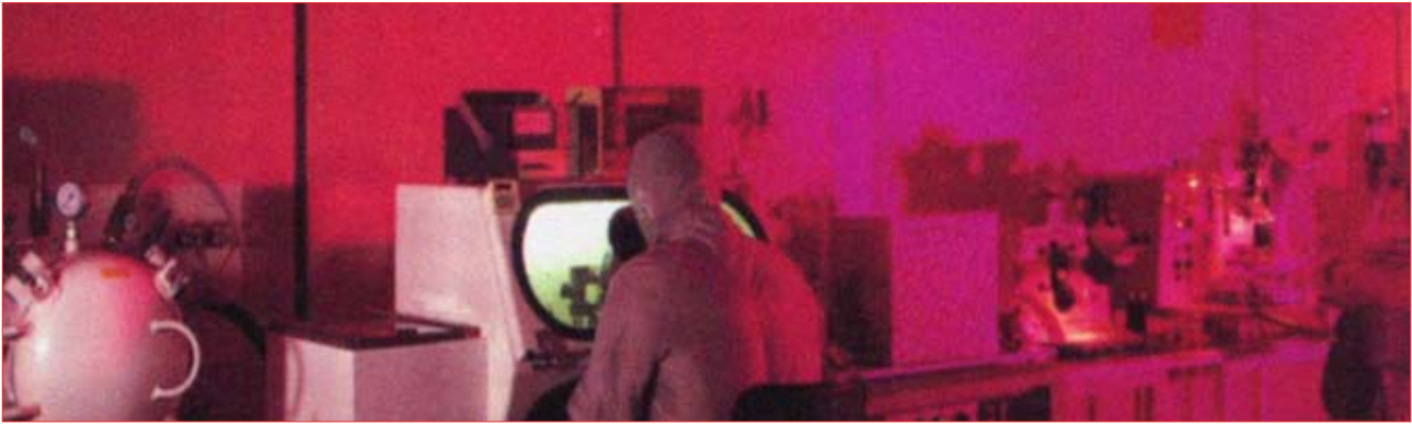
Detector production and test facilities