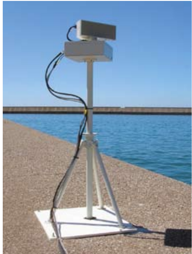
Mini INGRID Radar Unit and basement.