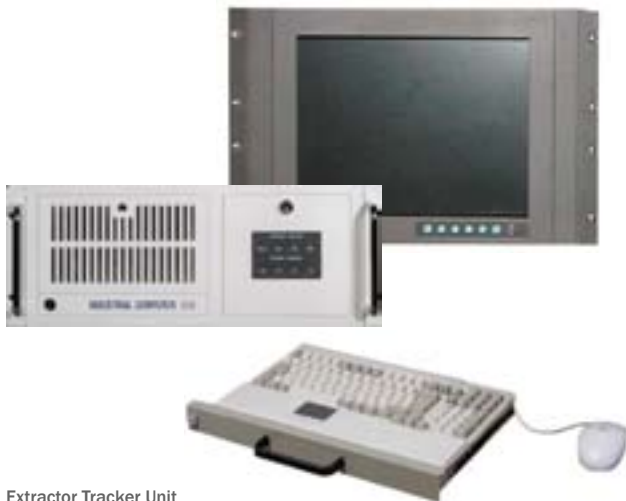
Extractor Tracker Unit