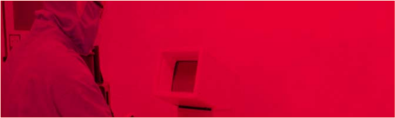
Detector production and test facilities