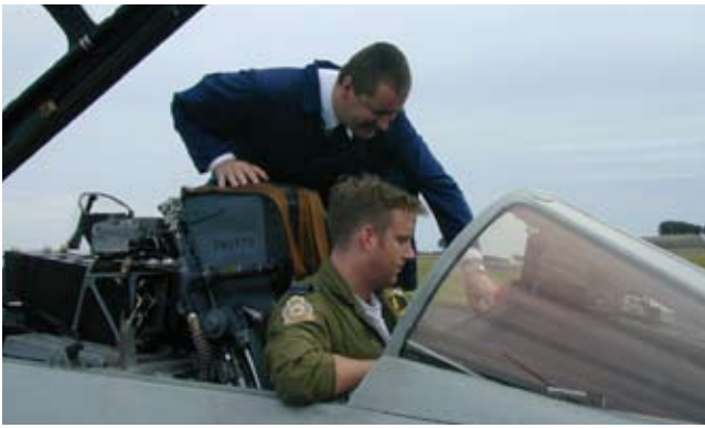
24 x 7 mission ready systems