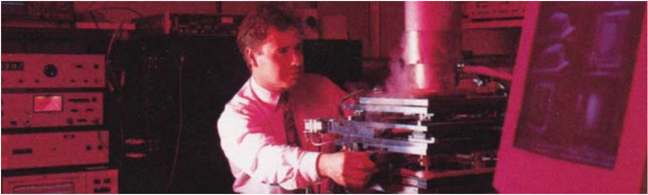
Detector manufacture and test facilities